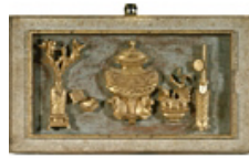
Chinese Relief-carved Giltwood >